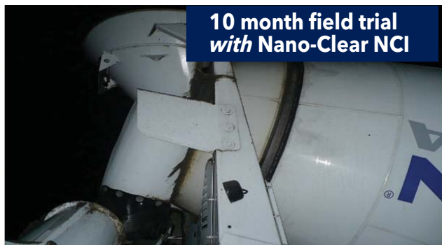
Even sticky concrete dust releases easily from Nano-Clear NCI